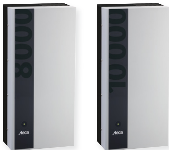
StecaGrid 8000 3ph

The combination of the StecaGrid 8000 3ph and the StecaGrid 10 000 3ph allows optimum design for almost any power class. A diverse range of combinations are possible but they all share the same goal: the effective use of solar irradiation.